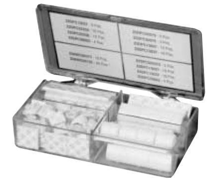
Over 100 Adhesive Backed Cable Clips in 10 Sizes including Single, Double and Releasable Styles.