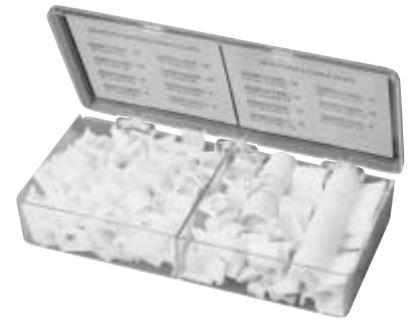
Over 140 Cable Clips In 15 Different Styles & Sizes