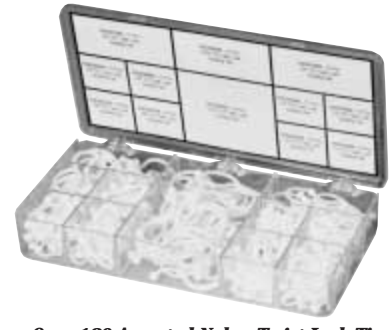
Over 180 Assorted Nylon Twist Lock Ties in 6 Popular Sizes.