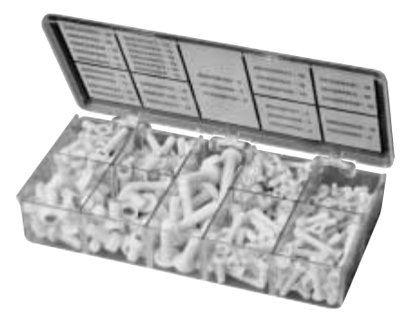
Over 300 NYLON METAL CORE SCREWS Over 30 Different Sizes and Headstyles.