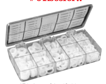
All in Assorted Outside Diameters and Thickness Ranges.