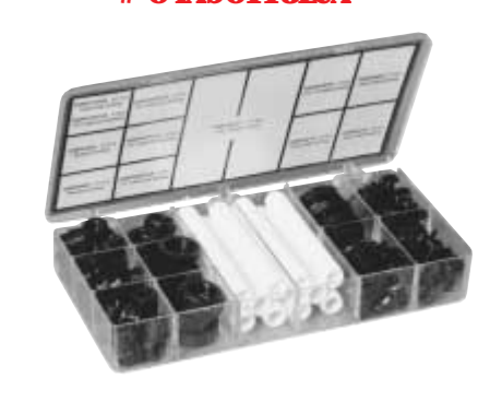
Over 100 Lamp Accessories