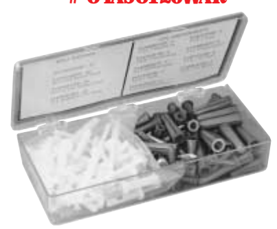
Over 115 Nylon Screw Anchors in 12 Different Styles and Sizes.