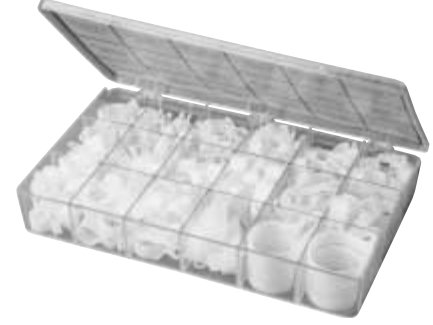
Over 290 Cable Clamps in 18 Popular Sizes.