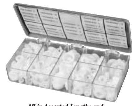
All in Assorted Lengths and Shoulder Height Combinations.