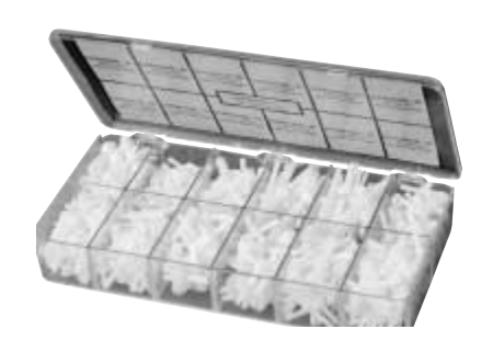
Over 380 Assorted Nylon Drive Rivets with Insertion Tool