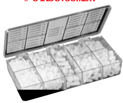
Over 750 Nylon Fasteners Over 40 Different Sizes and Types