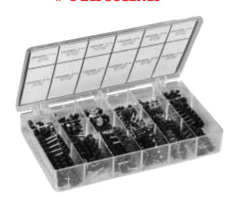
Over 500 Nail-In Clips In 6 Different Sizes and Types.