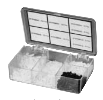
Over 700 Connectors 3 Different Body and Pin assemblies